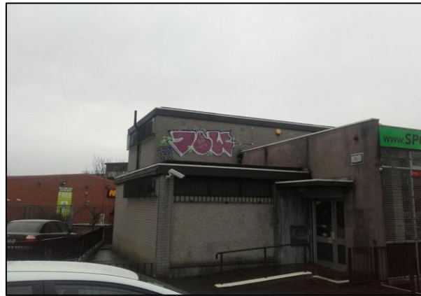
Graffiti in Finglas Village removed as part of recent graffiti removal operations

During December graffiti removal and wall painting was conducted in a number of areas. Walls were painted by DCC in Crannoge Road, Hazelcroft, Fairlawn, Ballygall Road West and walls in Berryfield were painted as a joint DCC and resident's initiative. Extensive Graffiti removal was also undertaken in Finglas Village and Balbutcher Lane.